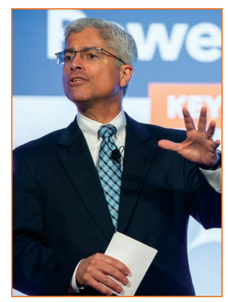
SCE President Pedro Pizarro explains the importance of grid modernization to support customer choice.